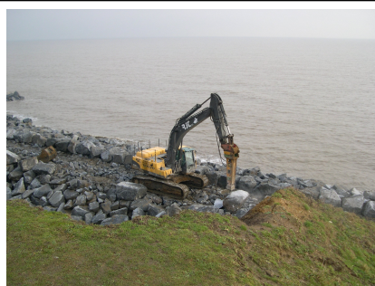
Crag Walk Works

I reported last year that the Town Council had made a grant of £10,000 to the Essex Wildlife Trust for preparatory work necessary for the Crag Walk project. In the event not all of the £10,000 was needed. The Town Council was pleased to contribute £4,502 (roughly the balance) towards the design and production of five interpretive panels to be installed at the Naze. Work is now almost complete.