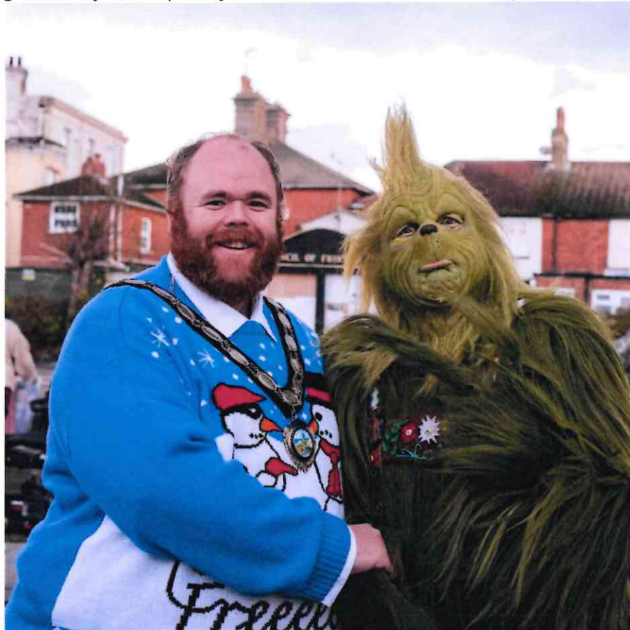
'The Grinch' was a popular guest at Walton's Late Night Shopping Event putting smiles on many children's faces!