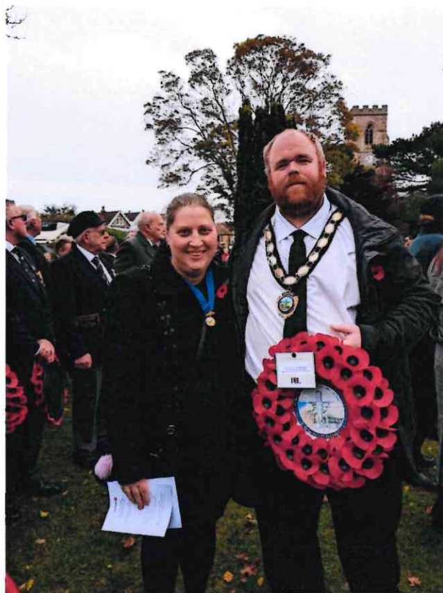
I had the honour of laying a wreath at the Remembrance Service at Walton Church with the Mayoress.