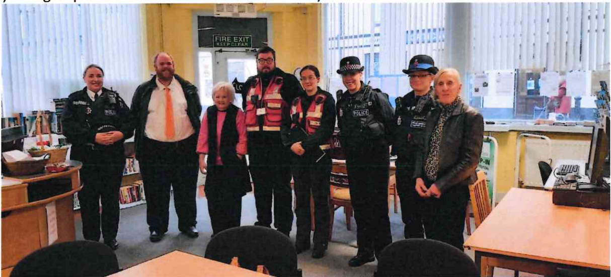
Multi-agency working with Essex Police, Tendring District Council Community Ambassadors and Town Councillors – kindly hosted by Walton Forum.

The Town Council works closely with the local PCSO's not only through funding their presence in the area, but also in liaison on community issues and supporting in ways to identify and reduce crime in the area. Some fellow councillors and I took part in the local Police Chief Inspector tours of Frinton and Walton, highlighting areas needing additional focus and talking to residents and business owners to strengthen relationships further. We have a good working relationship with key stakeholders in Essex Police. We have observed far fewer incidences of crime in the local area throughout the last year which has been down to effective policing, communication, and various other initiatives in the local area such as the offering of a local youth group that one of our Councillors is heavily involved in.