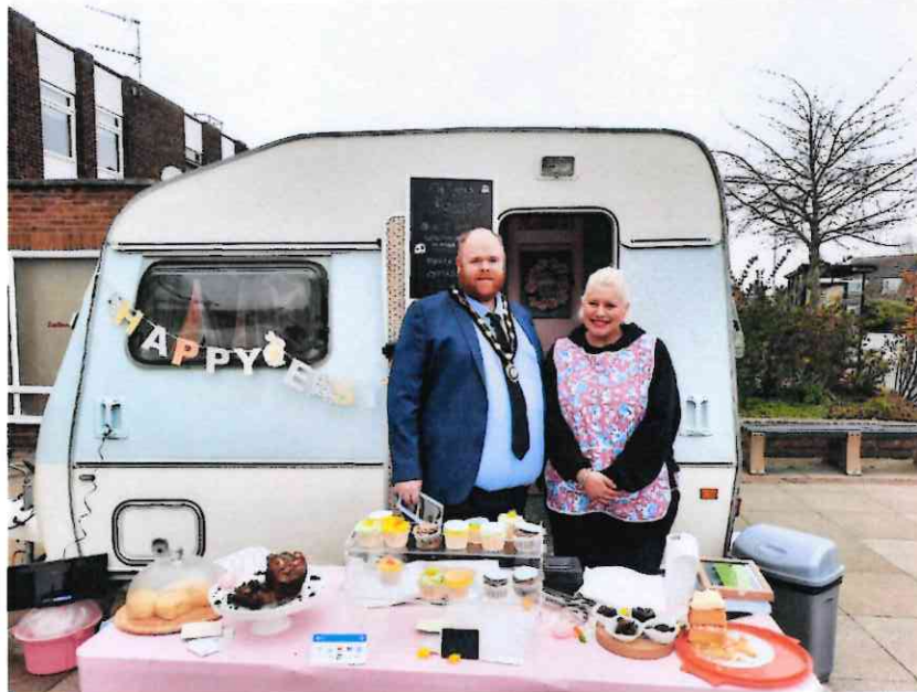
Easter Celebrations at the Triangle Shopping Centre