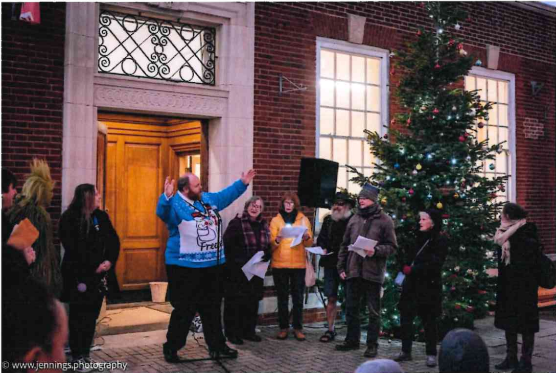
Getting into the festive spirit of the season at Walton's Late Night Shopping Event.